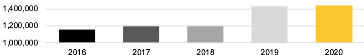
Projected refugee resettlement needs